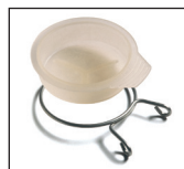
Patented anti-scale system